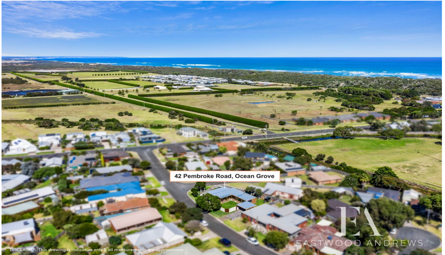
42 Pembroke Road, Ocean Grove