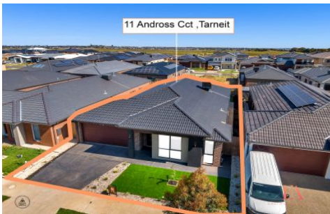
11 Andross Cct , Tarneit