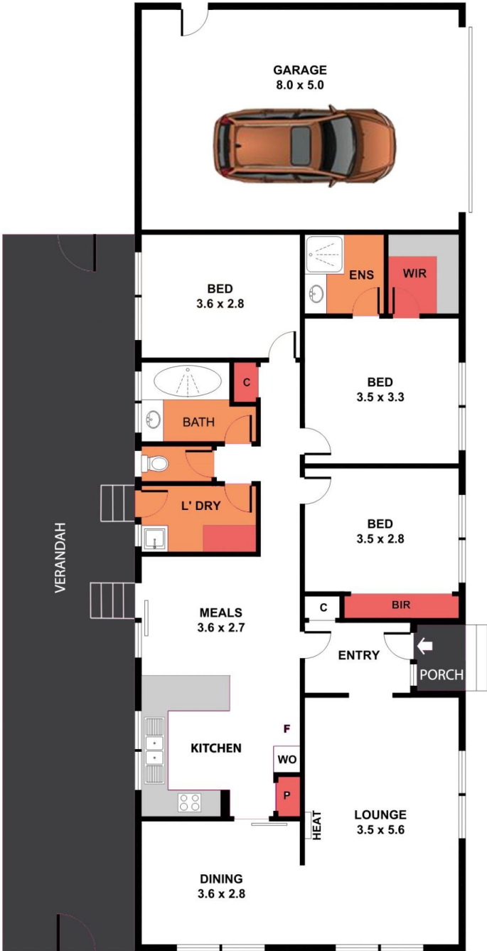
TOTAL INTERNAL AREA APPROX : 151 m 2